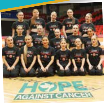
The Amy Billington Dance Academy at Leicester Riders

Thank you so much to those who have taken part in our Right Here, Right Now awareness campaign which aims to emphasise that the work HOPE supports is happening locally, every day.