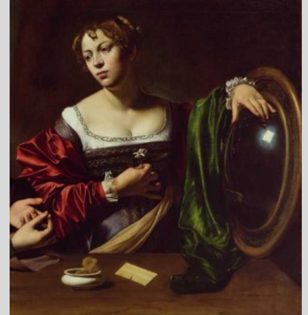
ST MARY MAGDALEN 27TH JULY

Mary of Magdala was healed of "seven devils" by Jesus. She ministered to him in Galilee and was present at his crucifixion. She was in the group of women who were the first to discover the empty tomb, and it was to her that the risen Jesus first appeared. The Western tradition is that Mary Magdalene is also "the woman who was a sinner" and the sister of Martha and Lazarus of Bethany. There is no evidence either way, and the tradition is tenuous enough for even such authorities as St Ambrose to hold, with the East, that they are three different people. It seems, therefore, that although the Western tradition is to be respected and is a real inspiration, it may not necessarily be historical. (Indeed, in 2021 Mary of Bethany was formally recognised as separate, being included in the same feast as Martha and Lazarus, a week after Mary of Magdala). This kind of ambiguity is inevitable in a religion such as Christianity, which is founded on definite historical events rather than myths which can be adjusted into logicity.