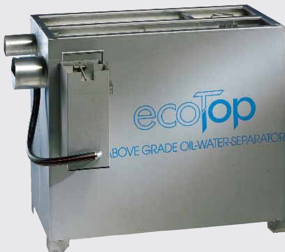
ecoTop NS 03 model