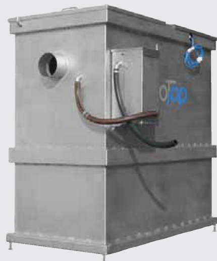
ecoTop NS 10 model