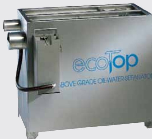
An investment that is built to last: ecoTop's high grade stainless steel vessel.

The outstanding test results achieved at noted testing institutions show that ecoTop will be able to meet even tougher future standards.