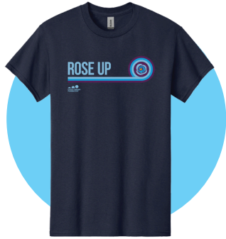
LEVEL 1: $100 ROSE UP T-Shirt*

It is our way of saying "thank you" on behalf of the children and adults living with cystic fibrosis. To qualify for a reward, please register at fundraise.cff.org/RoseUp