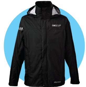
LEVEL 4: $2,500 Marmot® Precip Eco Jacket**