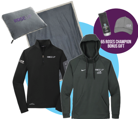
LEVEL 3: $1,000 Eddie Bauer® ½ Zip Fleece** Nike Therma-FIT Pullover Fleece Hoodie Field & Co.® Sherpa on the Go Blanket