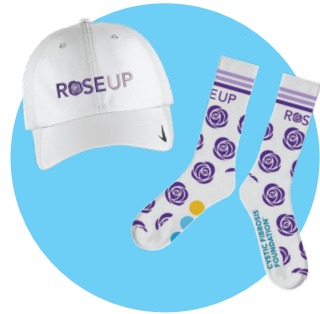
LEVEL 2: $650 Nike® Sphere Dry Cap Athletic Socks