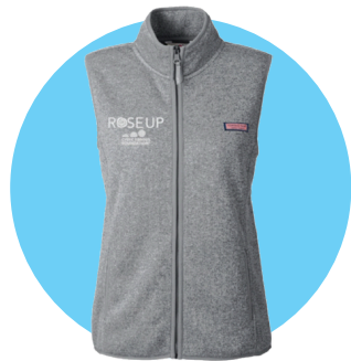
LEVEL 5: $5,000 Vineyard Vines® Vest**