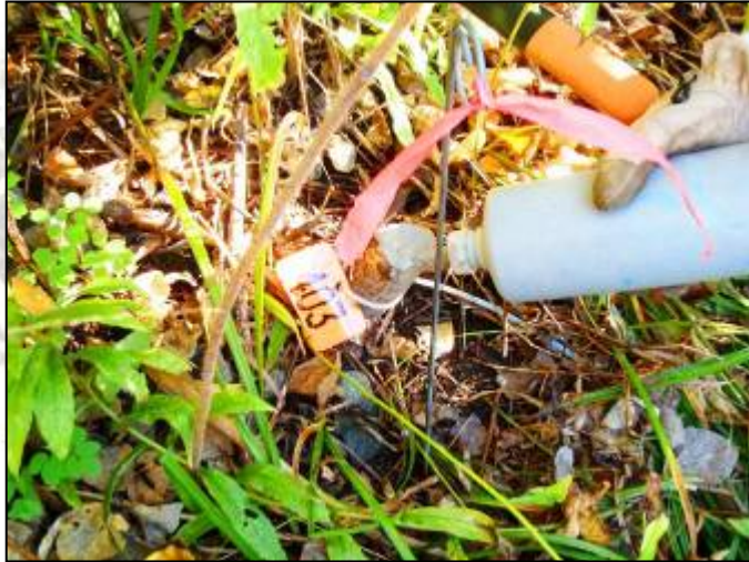
Trees were treated with an alternative fungal bio-herbicide.