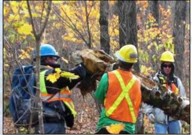
Sault College students got hands-on training in recreational trail maintenance.

During the summer, native shrub species were planted in test plots located in the hydro corridor. These plots are designed to provide enhanced habitat in the corridor, while not growing to a height that would interfere with power lines.