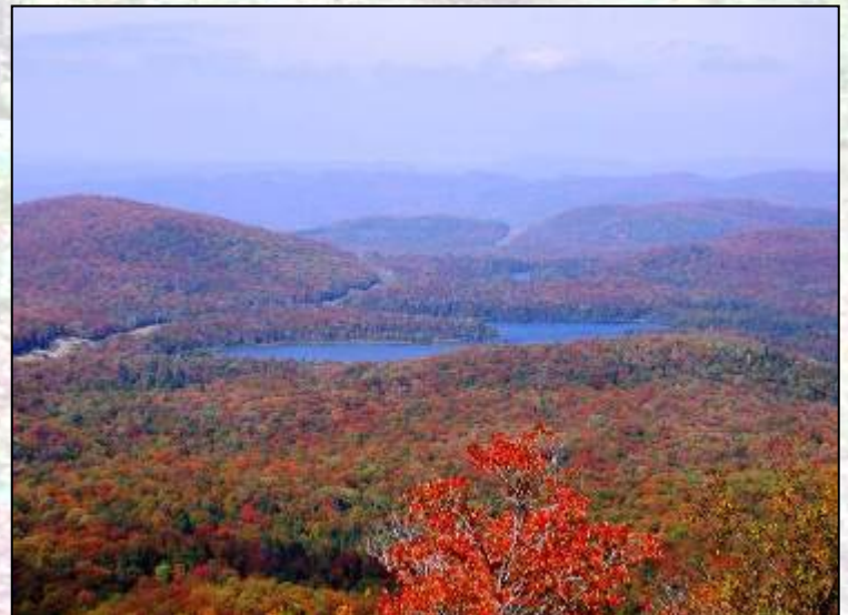
View from the King Mountain Hut lookout.