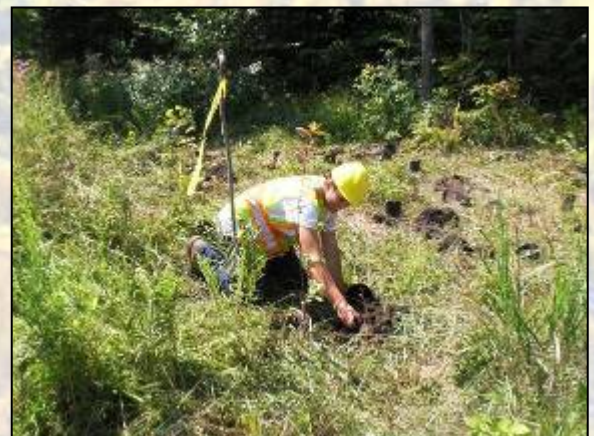
Shrubs were planted in test plots to increase habitat availability in the hydro corridor.