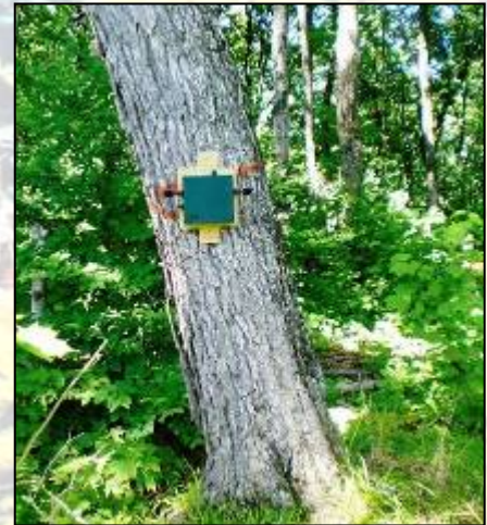
Bio-acoustic monitoring devices were installed to determine bird species using the hydro corridor.