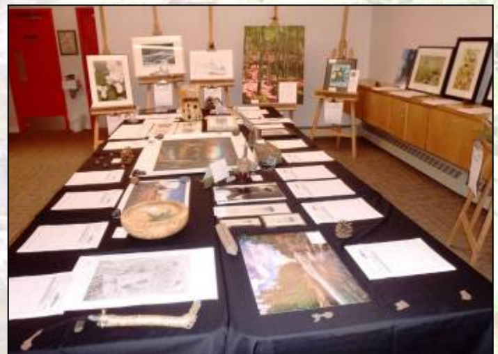
Artwork ready for auction.