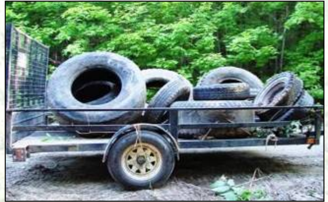
A few of the 54 tires removed in this summer's Robertson Creek Dump Clean-up.

With a new trail to show off, we invited friends, family and long-time visitors to a September "Bike and Hike Day" where participants had the opportunity to join in guided bikes and hikes led by members of the Sault Cycling Club and the Voyageur Trail Association. Afterwards everyone gathered around for a delicious and well-deserved BBQ lunch served up by AHC Board Members and Staff.