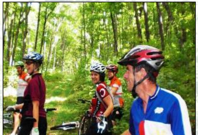
Mountain bikers took to the trails on Bike and Hike Day.