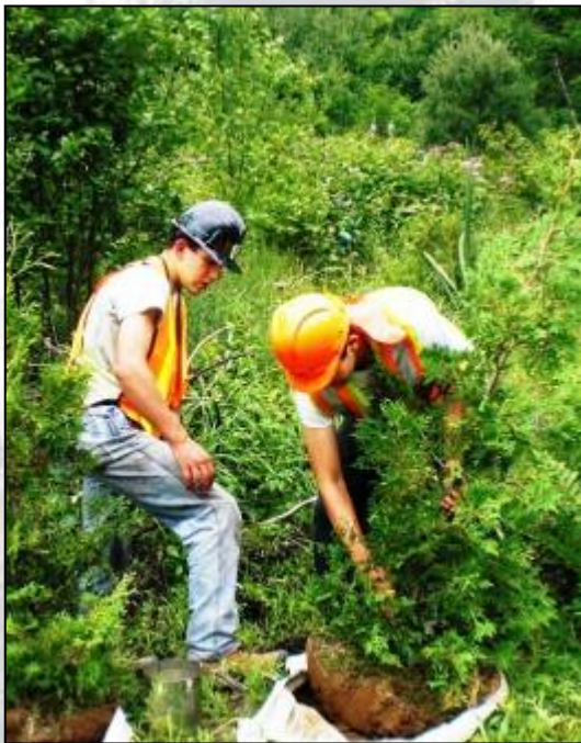
Cedar trees were planted on the banks of Stokely Creek.