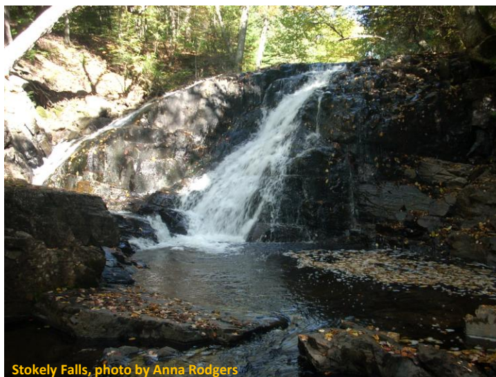
Stokely Falls

This annual report documents our significant achievements in relation to this mission for the reporting period January to December 2009. Our collective achievements reflect the dedication and passion of our Board volunteers, our staff and many other individuals, agencies and partners who provide grass-roots support.