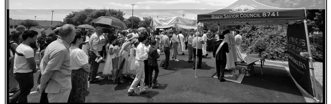
Corpus Christi Procession 2026

"The Eucharist is truly a glimpse of heaven appearing on earth. It is a glorious ray of the heavenly Jerusalem which pierces the clouds of our history and lights up our journey."