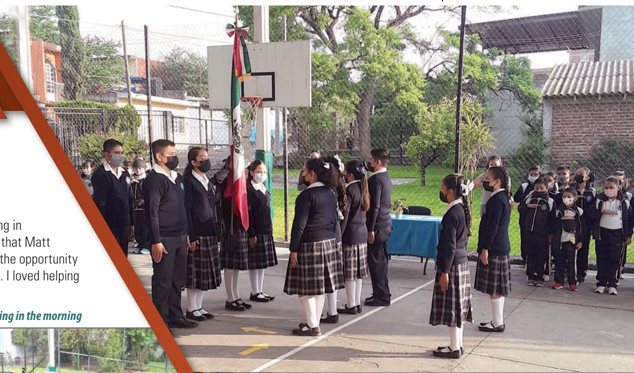
▲ Morning flag ceremony