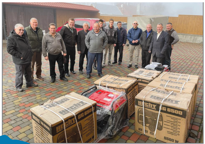
▲ Much needed supplies and equipment for Ukrainian brethren

with the Antioch managing director directly or through a former EEC member who serves as Antioch President. The EEC treasurer makes a few phone calls monthly and transfers funds regularly. EEC members regularly receive messages and calls from brethren in Ukraine and Hungary. This correspondence is greatly appreciated by all parties.