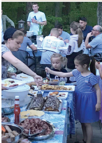
▲ Every culture bonds over food.