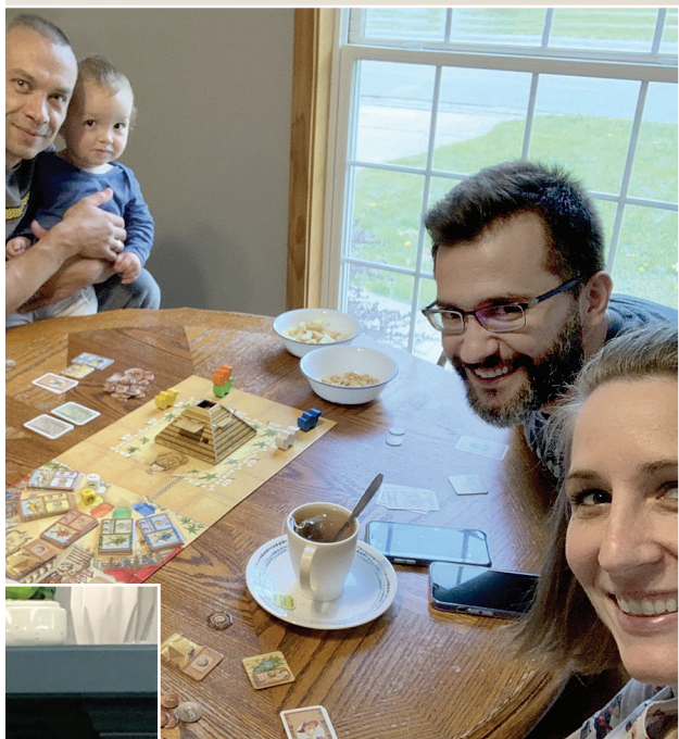
◀ Building a friendship with a refugee family

There are still thousands seeking refuge in the United States, some intending to return home at some point and some that would like to make their home here permanent, if possible. There are ways you can get involved. Resettlement agencies are always looking for volunteers to help refugees that have come to the United States from Afghanistan, Ukraine, as well as countries from all over the world. Explore the website www.welcome.us to learn about opportunities to serve refugees as individuals, as families, or as a church. For