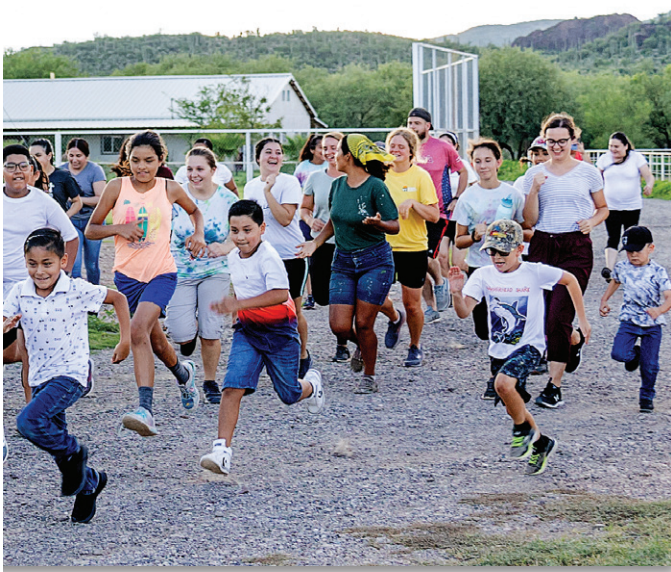
▲ Families enjoy a Color Run, a fun way to end summer camp.

school students and families. In October, HILOS families were invited to participate in CVE's annual Chili and Pie night. A group of students from the HILOS cooking class won the People's Choice competition for chili!