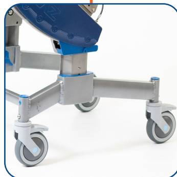
Invertible Base – High Range (24"-27")