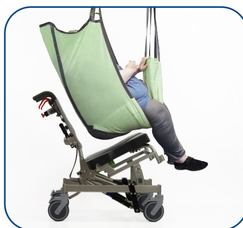
Transferring Into a Raz-AT600

The tilting feature of the Raz-AT600 allows for safer transfers when using a mechanical lift. The image above left shows a transfer into a non-tilting chair, which results in the client perched on the front edge of the seat. This is a potentially dangerous situation that can be avoided by using a pre-tilted AT600. Also, having the client on a tilted seat facilitates repositioning.