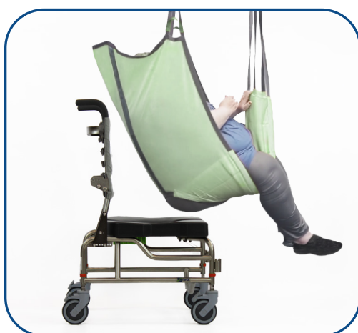
Transferring Into a Non-Tilting Chair