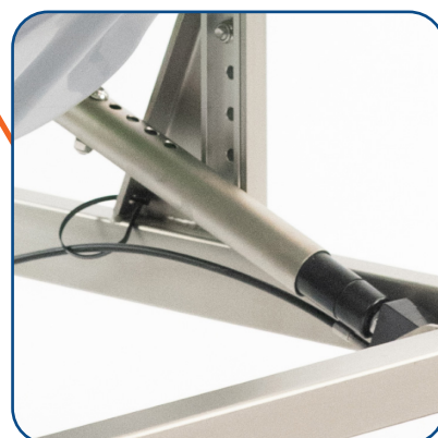
Pressurized Gas Struts