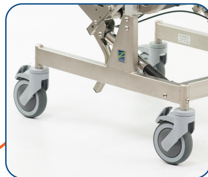
3" shorter base frame length vs. Raz-AT