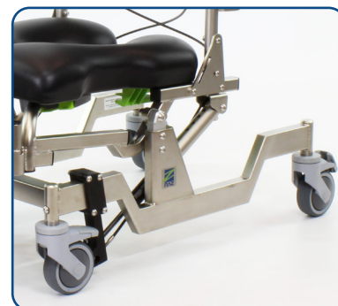
Super-Low AT (5" lower)