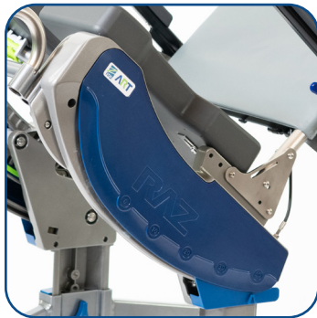
Patented, Dual-Arc Tilt Geometry

Maintains a near-constant location of the center of mass (CoM), which greatly reduces tilt effort.