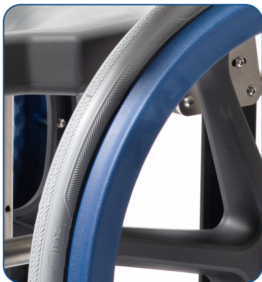
Ergonomic Handrim with thumb groove and finger notches