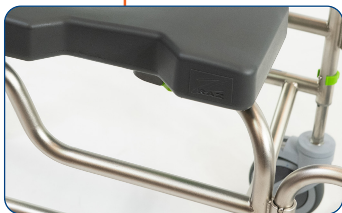
Unrestricted Side Access

Recessed, dipped front cross tube allows for better toilet bowl access and facilitates standing-pivot transfers