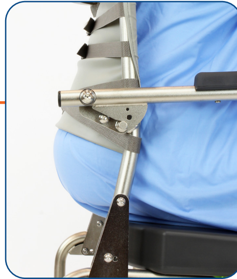
Gluteal Shelf Accommodation

Lower bend in back canes and tension-adjustable upholstery are standard on all Raz bariatric chairs.