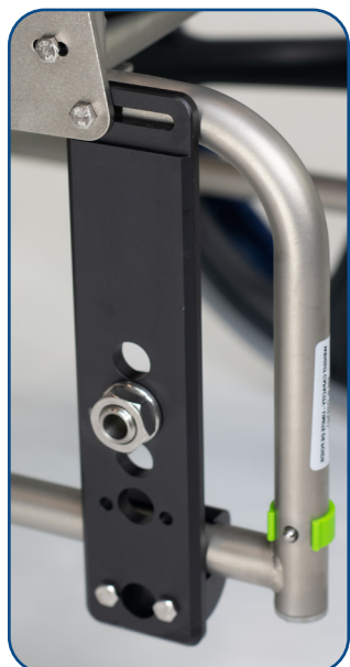
Adjustable Axle Plate