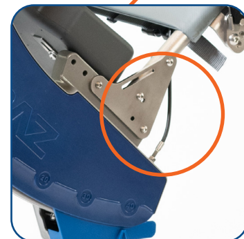
Innovative Cable Management System