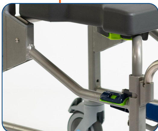
Unrestricted Side Access

Designed with forward arch and low pivot point to allow the Züm to be positioned fully over a toilet