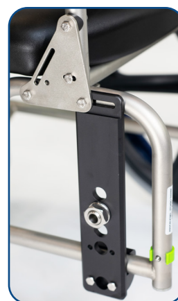
SP Axle Plate

Our design philosophy centers around the principle of modularity. Raz MSCCs can be configured to accommodate the client's medical condition and functional needs.