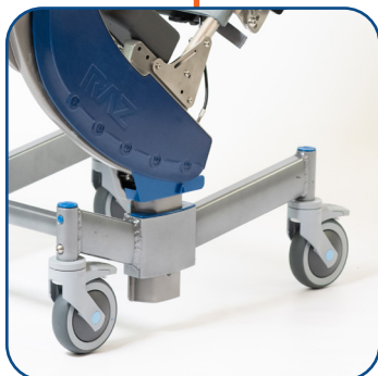
Invertible Base – Low Range (20"-23")