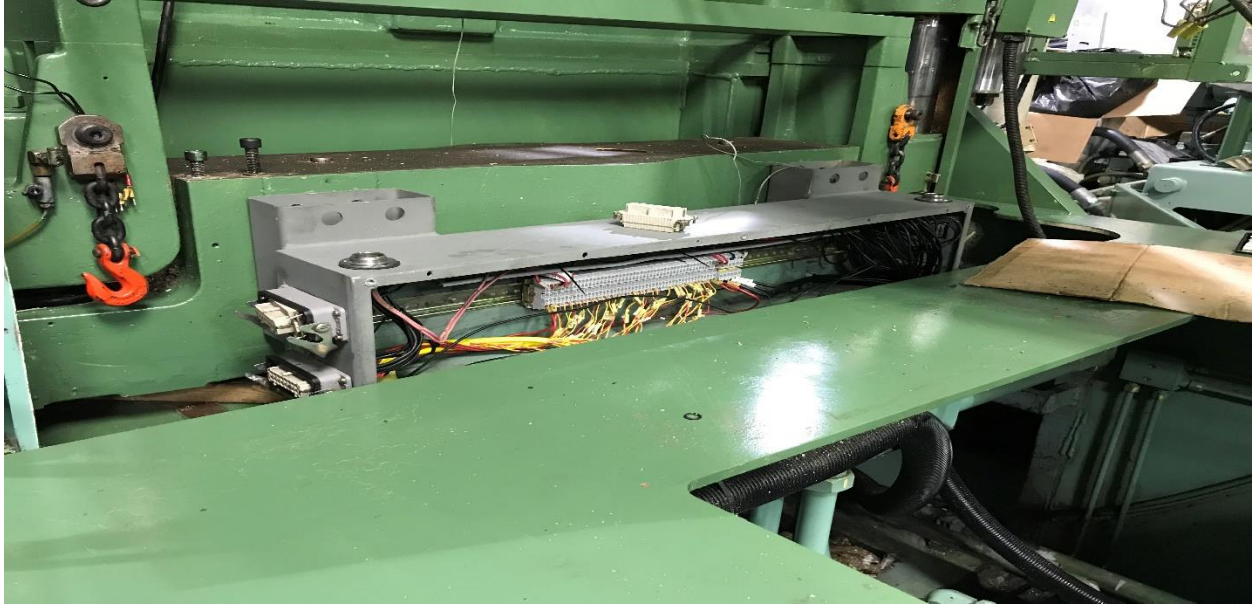
Hot Runner box: new wires & thermocouples