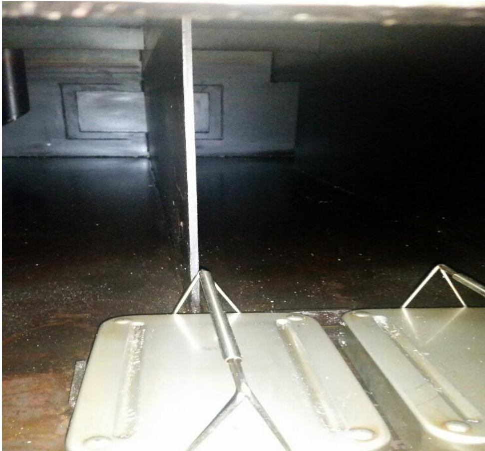
Oil tank Flush