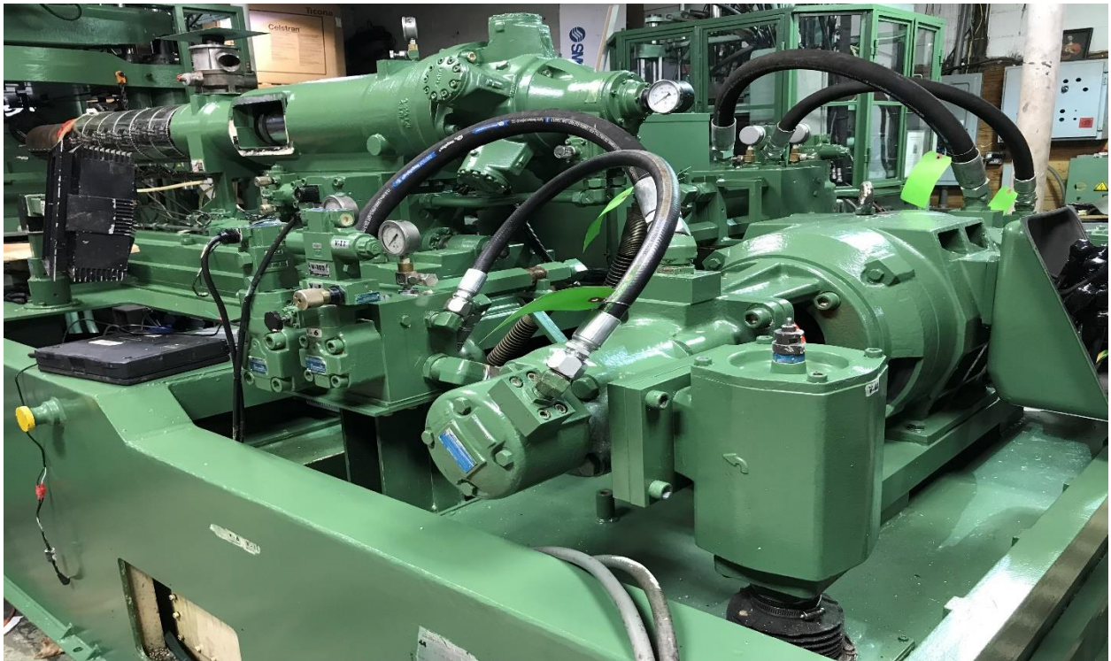
Hydraulic hoses replacing: Pump section: (5) Upper mold: (4) Lower mold: (3) Tank: (5)