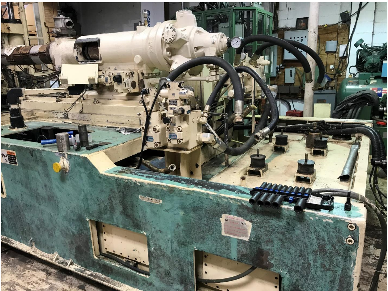
Toshiba motor and Heater Exchange out for service