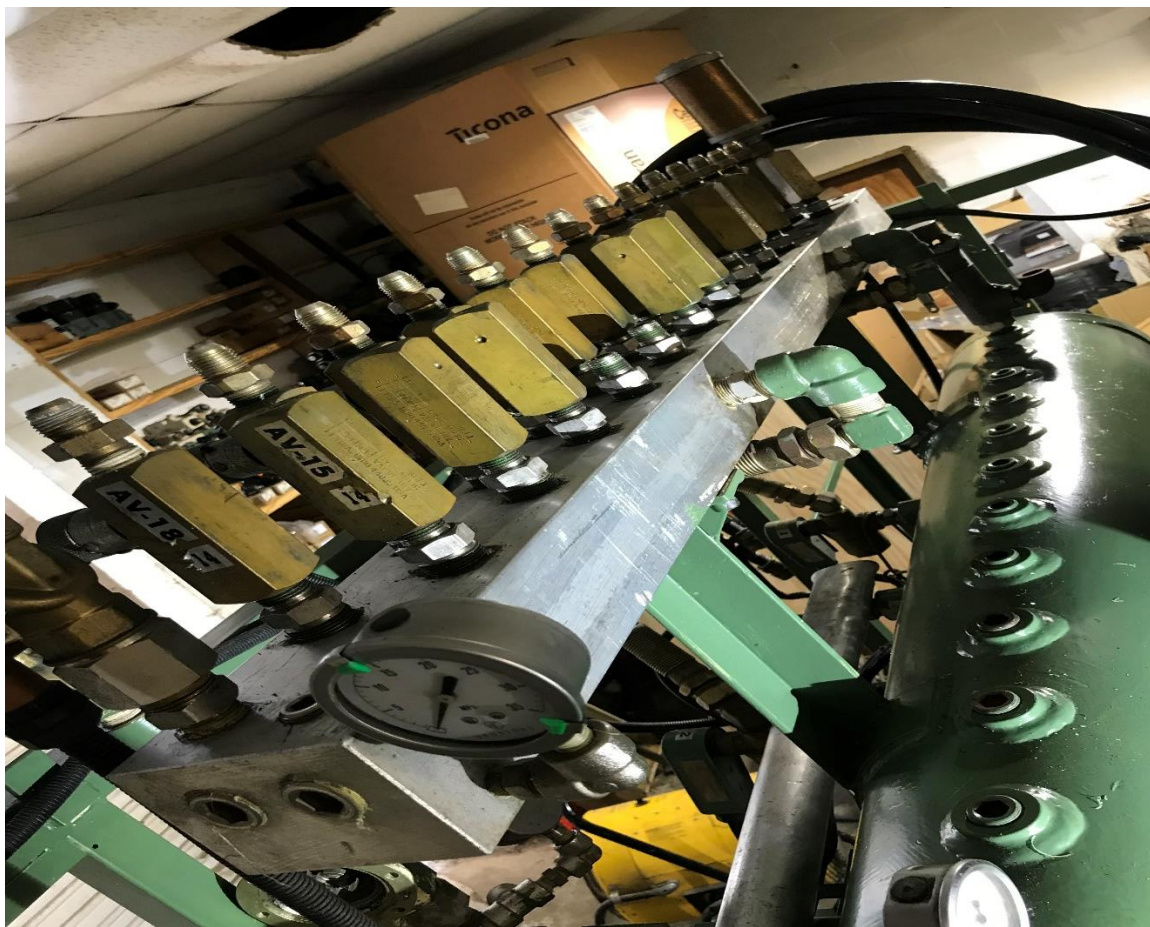
High pressure check valves replaced: (5) & V284