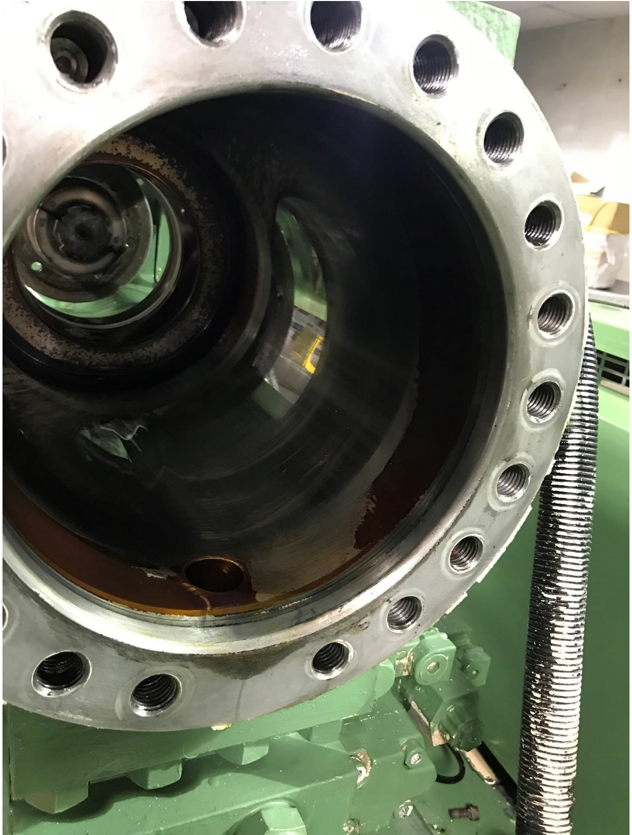
Replacing: O rings, bearing, V packing and metal rings, the cylinder is good