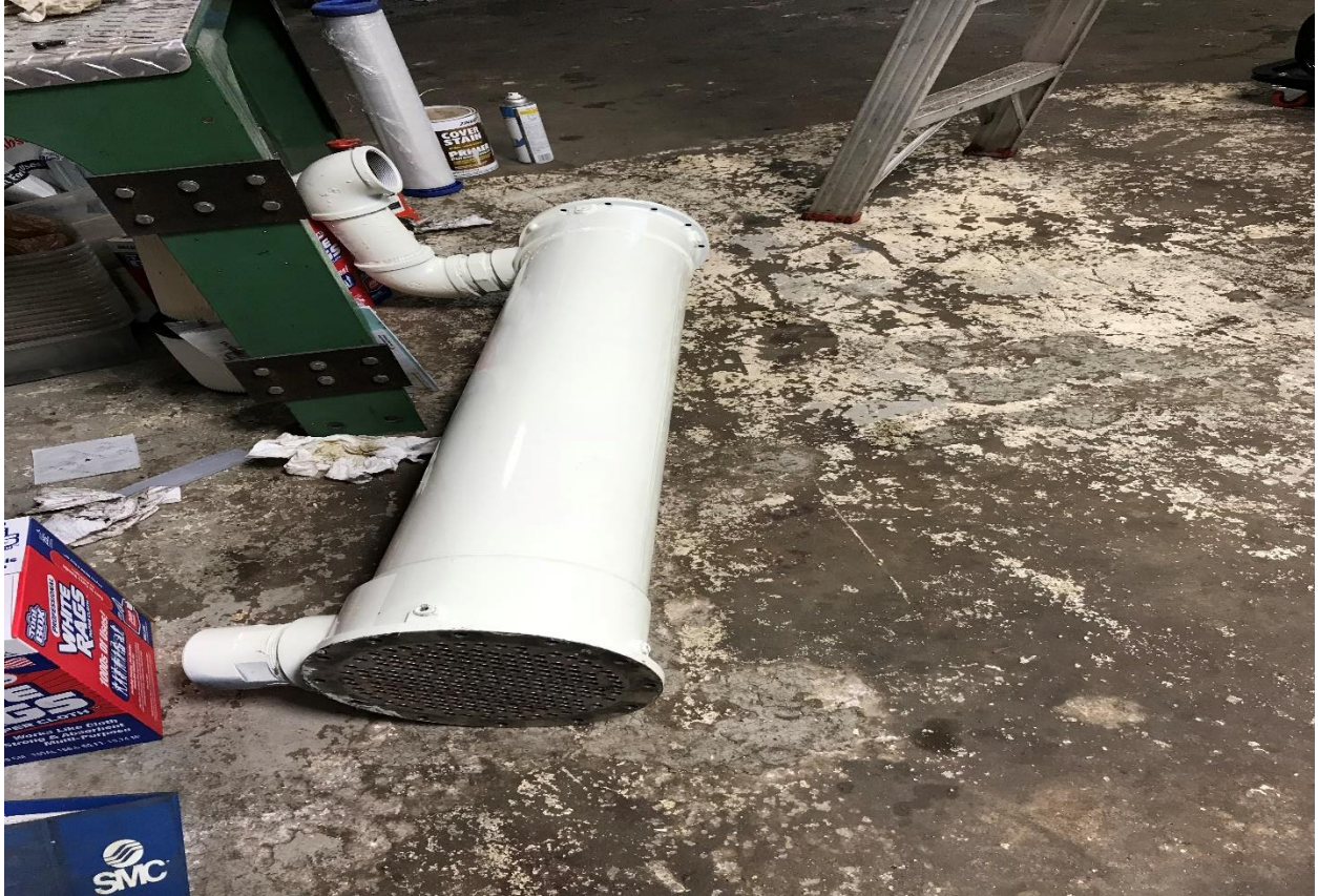
Heater Exchange: Clean, dip, flush, pressure test, new gaskets & zinc bars