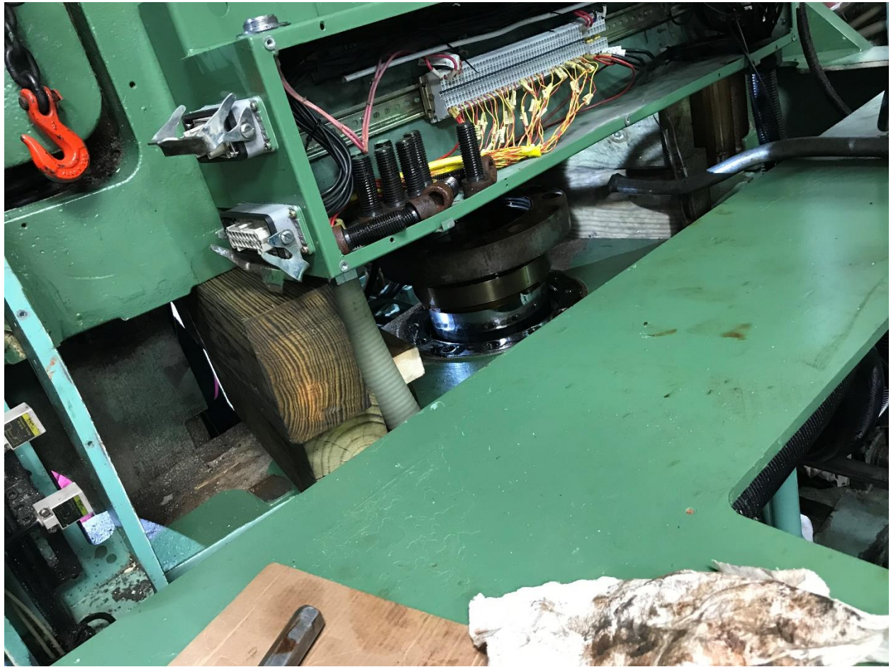
Lower mold top end cap seals