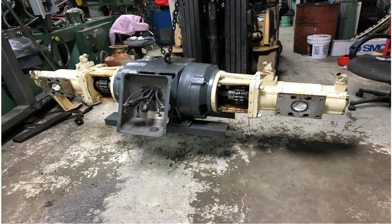
Toshiba Motor: Tested, clean, dip, new bearings, Pumps: new seals & bearings. Chains coupling inspected