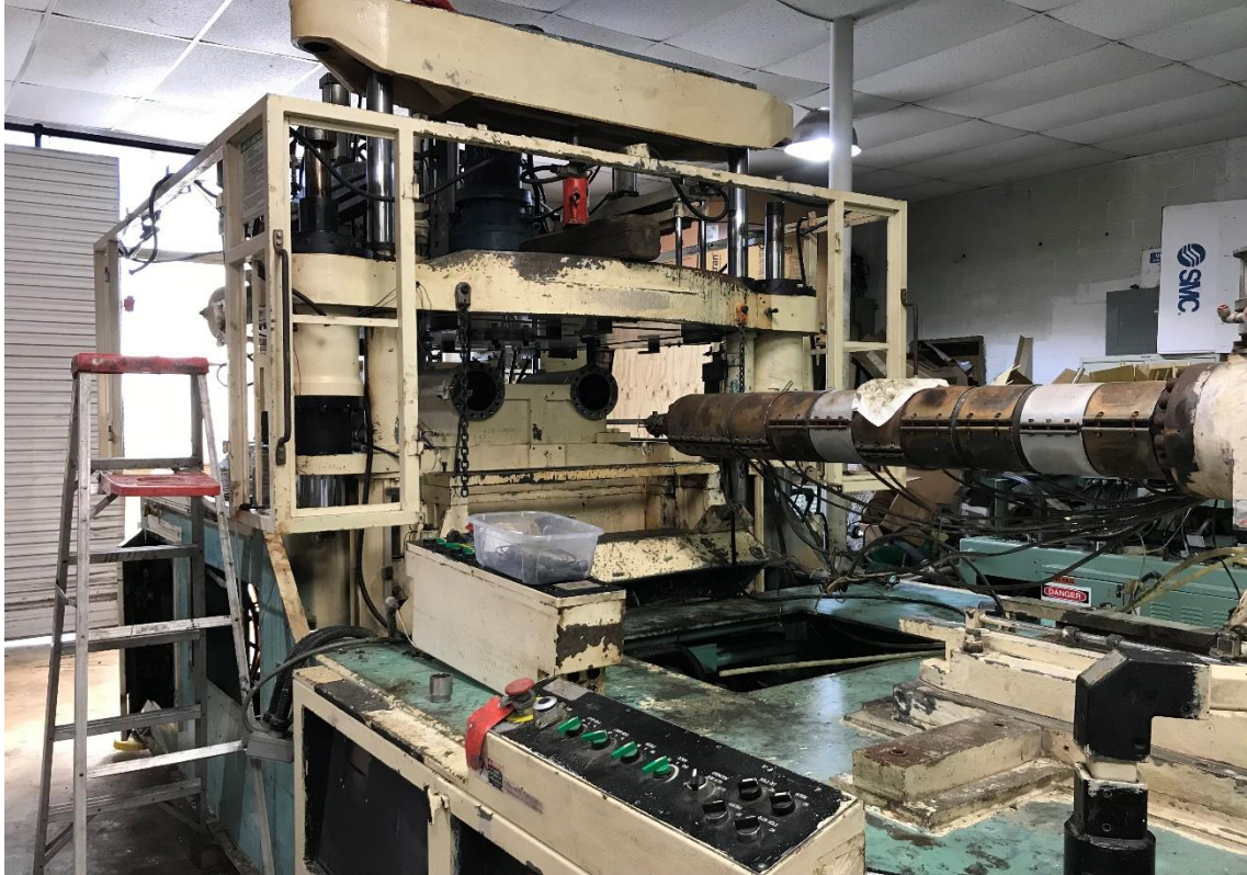
Upper mold cylinders seals