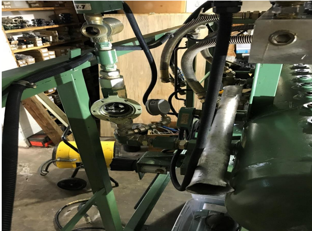
Primary air pressure regulator: new seals. Asco valves: inspected