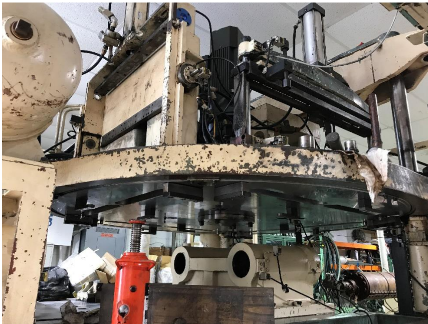
Blow mold cylinders: Seals, new Unbrako bolts for blow platen a & b