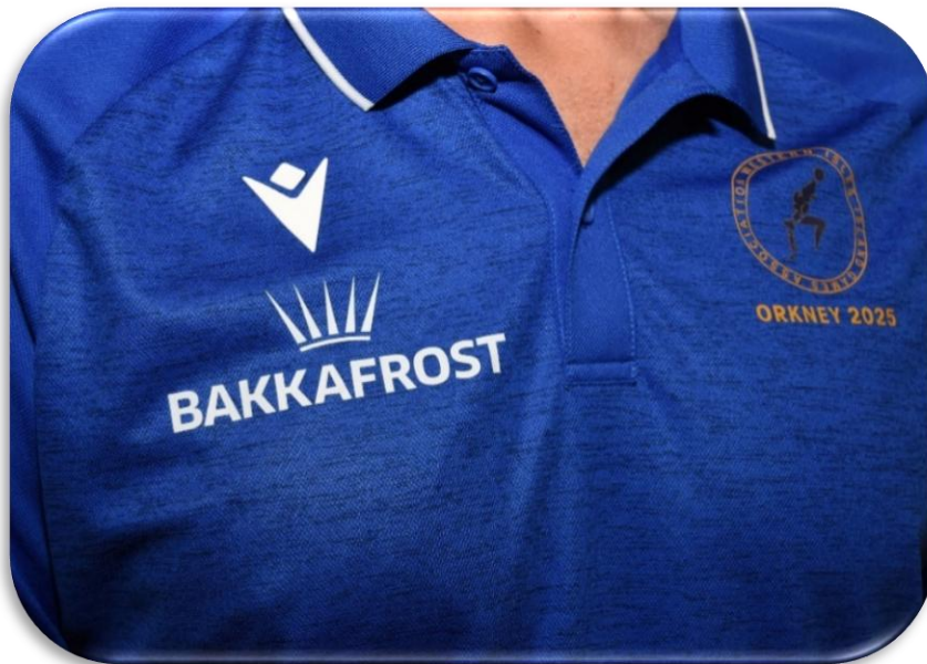
Bakkafrost sponsored team kit

With a large squad heading to Orkney, the support given to the team through sponsorship was as vital as ever. As in previous years, Bakkafrost Scotland were the main team sponsor and this allowed WIIGA to invest in sponsored team kit as well as helping with the overall promotion and wider costs associated with the Island Games.