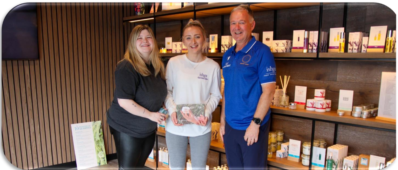
In addition to sponsorship, Ishga also provided a number of products to help the team at the Games

In addition, the team were greatly boosted by additional sponsorship from Ishga, Scottish & Southern Electricity Networks, Urras Oighreachd Ghabhsainn and Northland Power . These contributions allowed for the purchase of additional kit and contributed to a reduction in competitor fees, significantly assisting our athletes to compete at the Games. Cala Hotels also supported the team by providing a van which transported equipment from Stornoway to Kirkwall and around the venues during the week of the Games.