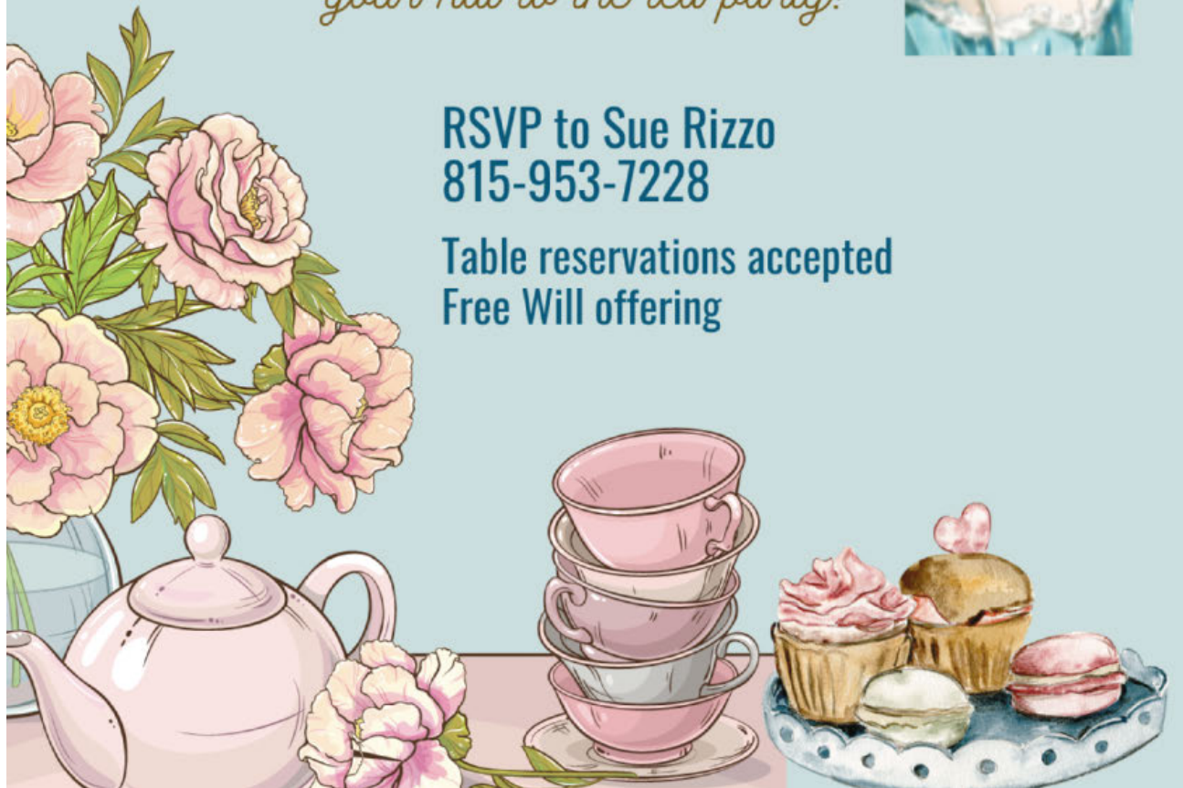
Table reservations accepted Free Will offering