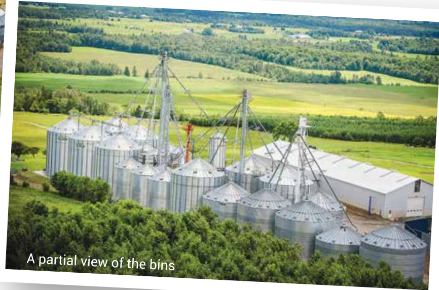
A partial view of the bins