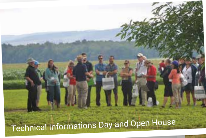
Technical Informations Day and Open House