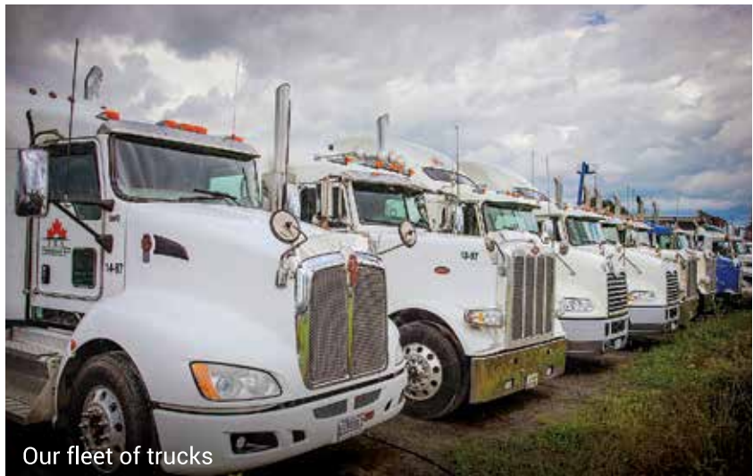
Our fleet of trucks