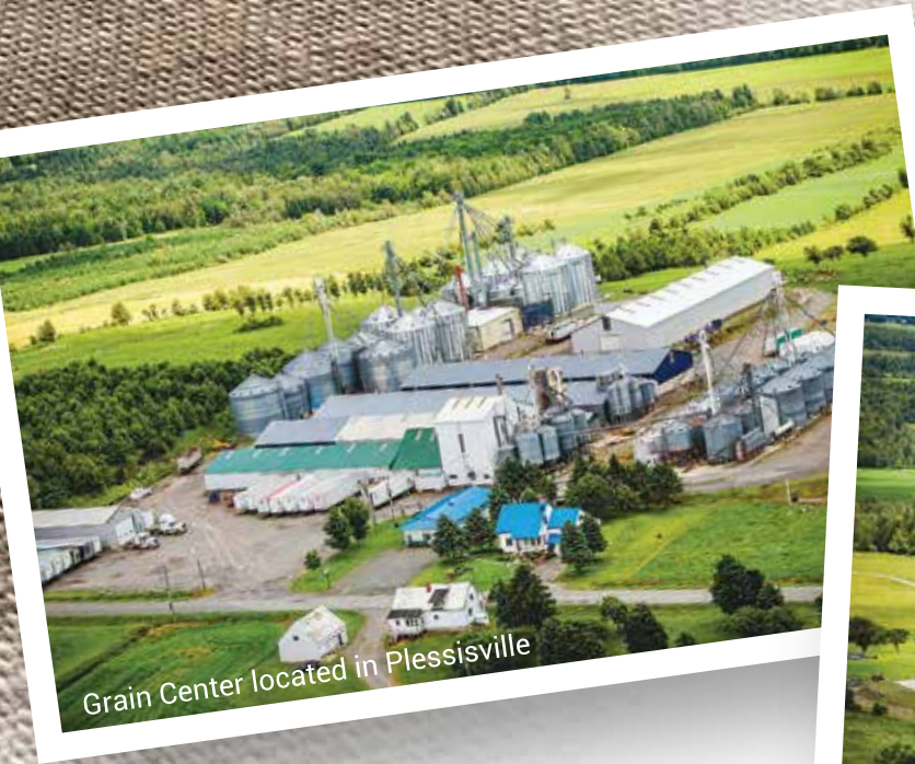
Grain Center located in Plessisville