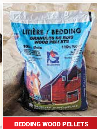
BEDDING WOOD PELLETS

Available in 100 % recyclable bag of: 35 lb (15.89 kg)