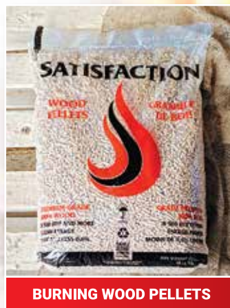
BURNING WOOD PELLETS

Available in 100 % recyclable bag of: 40 lb (18.14 kg)