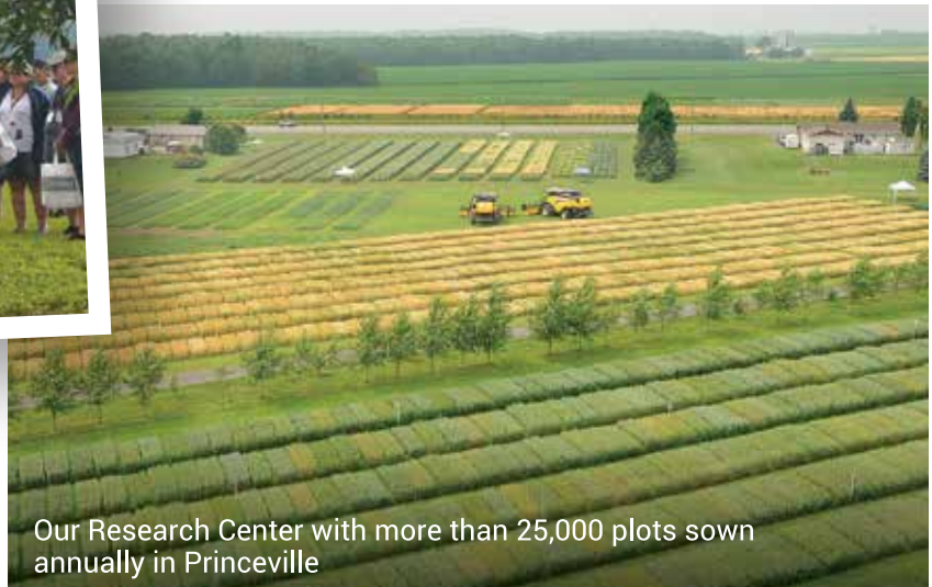
Our Research Center with more than 25,000 plots sown annually in Princeville