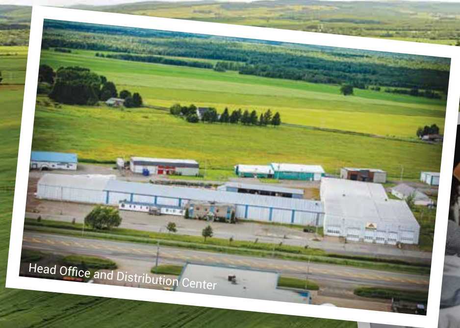
Head Office and Distribution Center