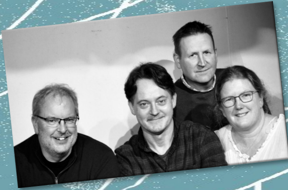
The Band: Sleighed (geddit?)