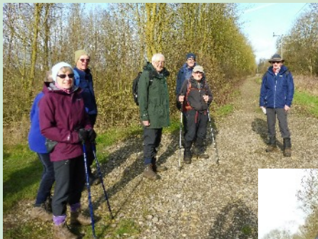
Members of the Walks Group on Dunston walk & taking a break at a rest area with information phone box requesting donations for Kenyan farm.