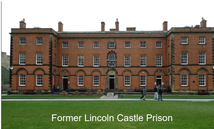
Former Lincoln Castle Prison