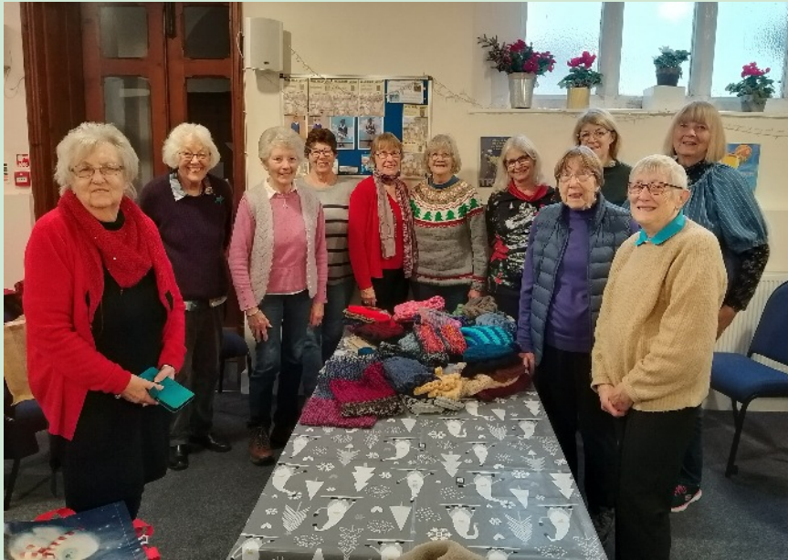
U3a Knitting Group with a selection of their knitted hats for the YMCA and homeless