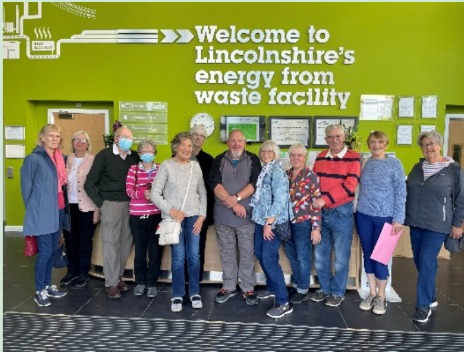
Members of Sustainability Group visiting the waste facility