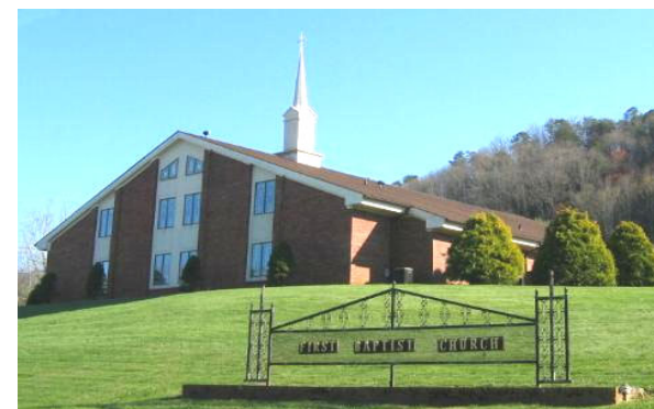
Andrews First Baptist Church