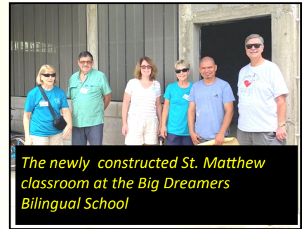
The newly constructed St. Matthew classroom at the Big Dreamers Bilingual School

The annual fundraiser dinner for the Honduras Mission will take place on Saturday, April 25 th at 6pm in the Community Center. There will be a taco bar, home brew, wine, and a dessert frenzy.