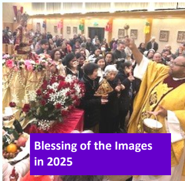
Blessing of the Images in 2025

Vigil Mass, which will include the blessing of children & Santo Niño statues. Following the Mass, a procession at the Community Center will take place, with devotees carrying their images while joyfully dancing & swaying to the rhythm of music and drums. A reception will follow after the procession. All are welcome to this joyful celebration honoring the Holy Child of Jesus.