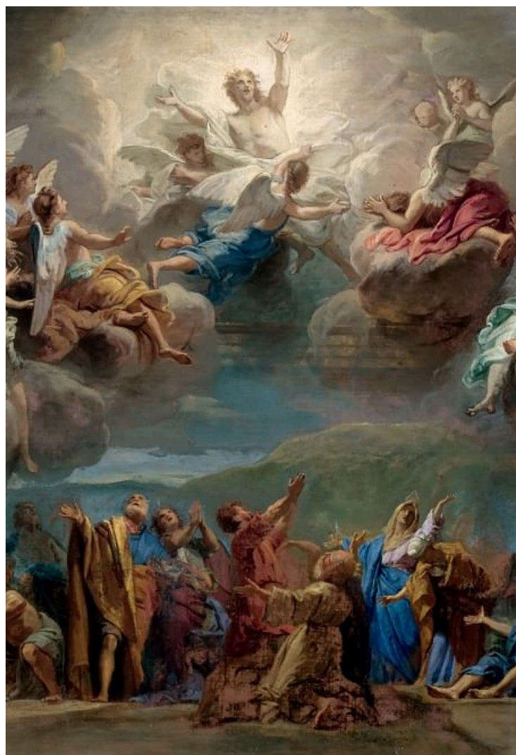
Descent of the Holy Spirit to the Apostles (Ascension of Christ) by Jean-Baptiste Jouvenet

St. Mark 18033 15 th Pl NE, Shoreline, WA 98155 saintmarkshoreline.org Church Hours: M-F 9:00 am - 4:00 pm