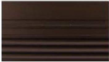
112-2S Class I Medium Bronze Anodized