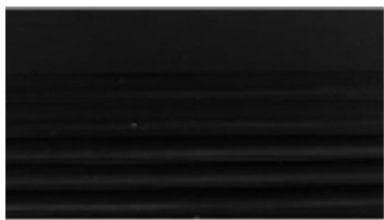
115-2S Class I Black Anodized