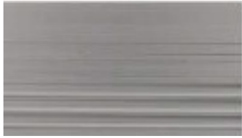
215-R1 Class I Clear Anodized