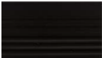
113-2S Class I Dark Bronze Anodized