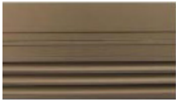
111-2S Class I Light Bronze Anodized