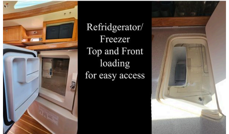
Refridgerator/Freezer Top and Front loading for easy access