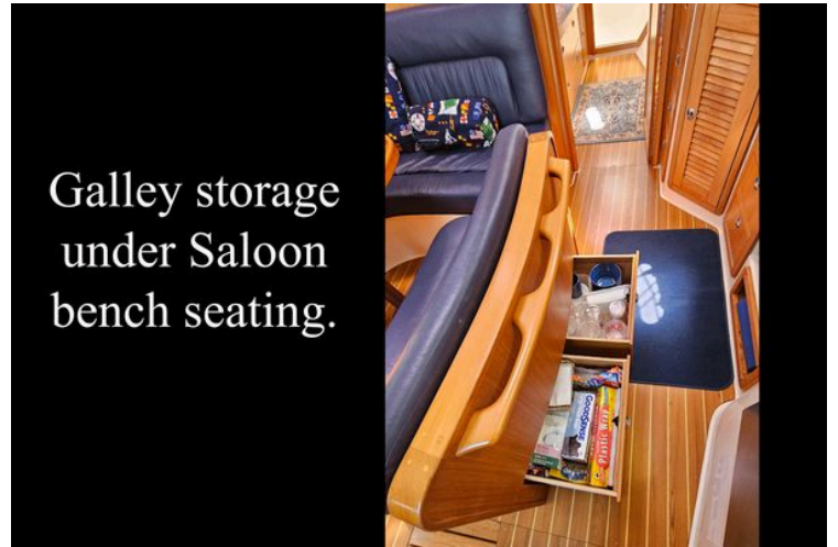
Galley storage under Saloon bench seating.