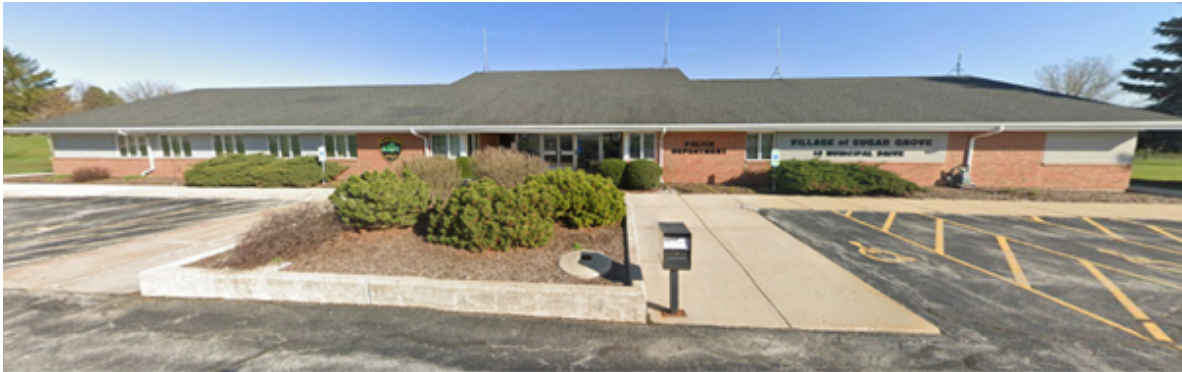
Sugar Grove Police Department

The Village of Sugar Grove is thrilled to announce the upcoming renovations and expansion of the Police Department. This project promises to enhance the efficiency and functionality of our law enforcement facilities. This significant undertaking is being spearheaded by the architectural firm Cordogan Clark, known for their expertise in designing modern and effective public safety buildings.