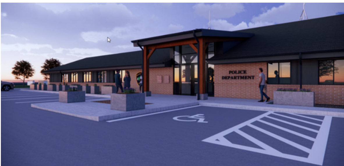
Rendering of the Remodeled Police Department

The project is expected to be completed within a budget range of $5 million to $6 million.