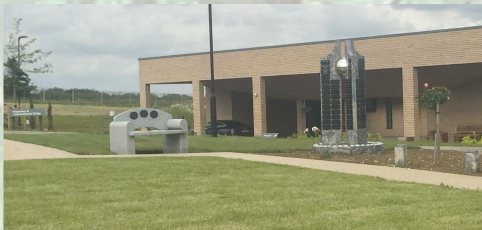
Above: Anniversary Scattering Lawn.