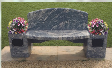
Above: Bespoke Seat with Vaults.