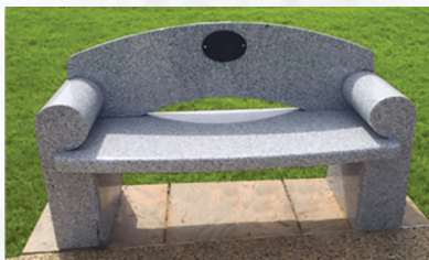
Above: Dedicated Seat.