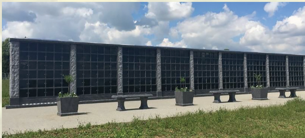
Above: Niche Wall with Planter and Benches.

The Niche Wall provides a focal point to remember and place flowers in memory of a loved one, available on a leased basis. The planters and benches are both available for communal commemoration.