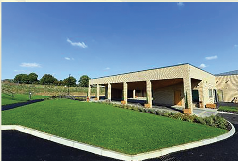
Above: Crematorium building.