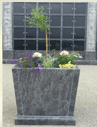
Above: Communal Planter

Within the garden there are memorials for commemoration that include a featured Niche Wall, Communal Planters and Benches.