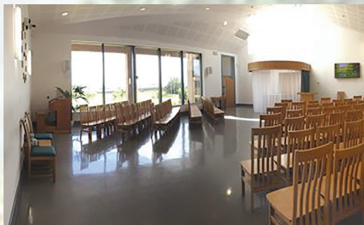
Above: View of the valley from and inside the Ceremony Hall/Chapel.