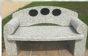
Above: Communal Seat.