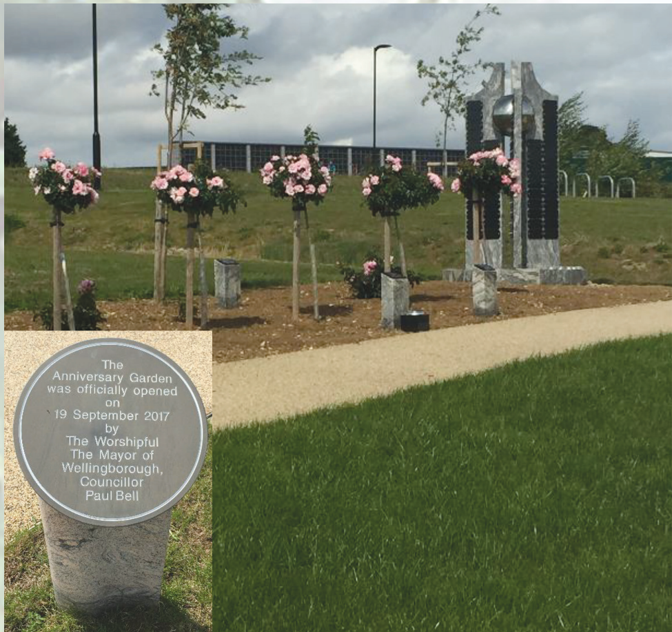
Above: Anniversary Garden – home to a Scattering Lawn for laying ashes to rest.