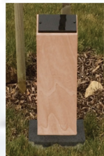
Above: Pillar, Rose, Tree and the Granite Marker (with Plaque for Roses and Trees.)