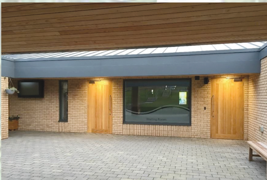
Above: Waiting room - since this photograph was taken a canopy has been installed above the courtyard to provide protection from the elements.

We will train our team to ICCM qualification level as the company is committed to recognising individual potential to support their professional development.