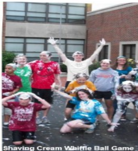
Shaving Cream Whiffle Ball Game

7th-12th graders 7pm-9pm Sunday-Thursday: