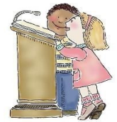
Children's Liturgy of the Word