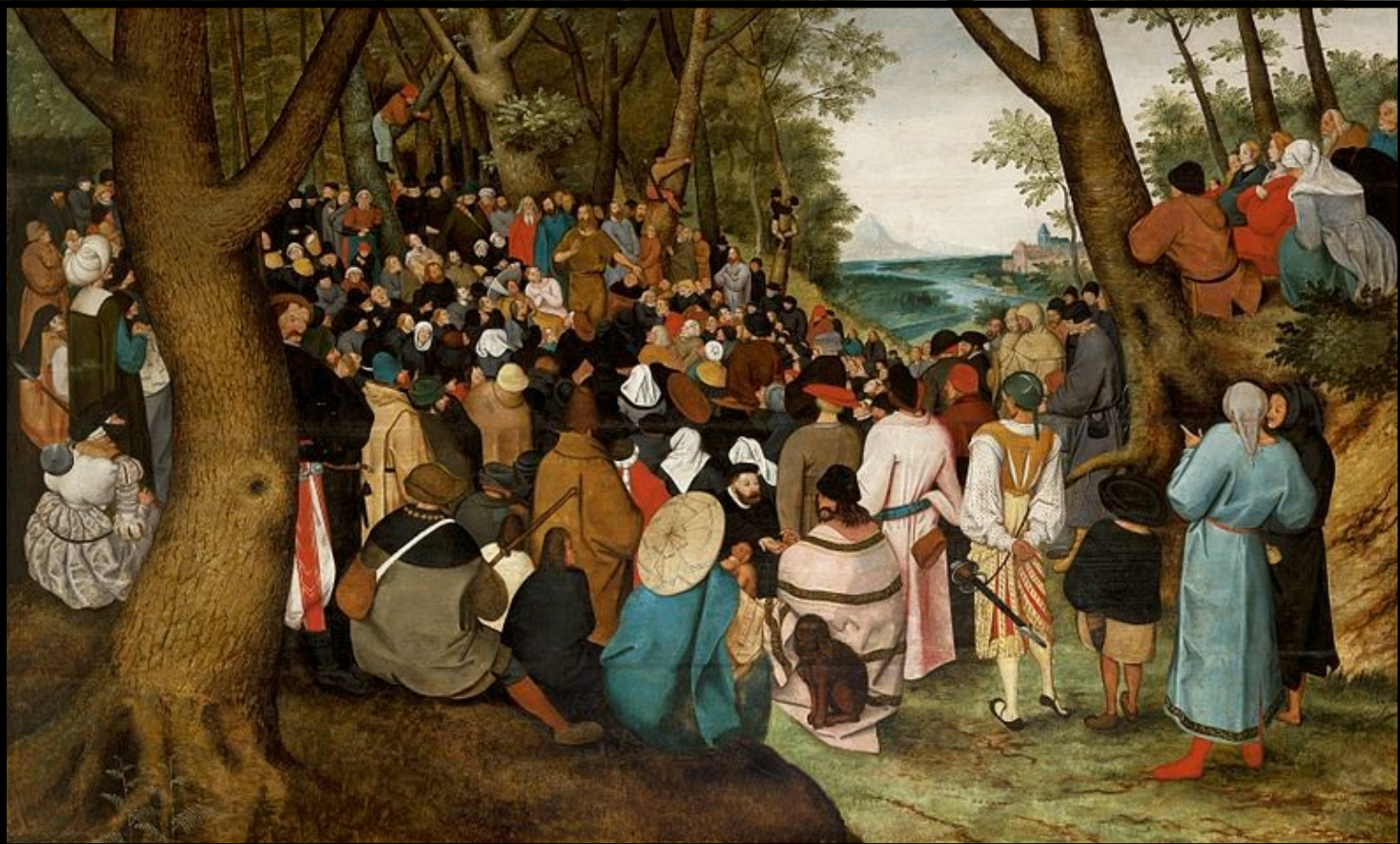
Brueghel, Pieter the Elder, 1566, Museum of Fine Arts, Budapest, Hungary.