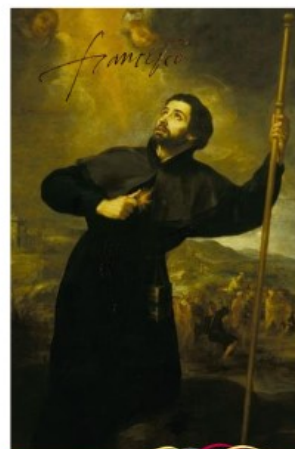
Praying with Saint Francis Xavier The Novena of Grace

God our Father, as St Francis Xavier travelled to the ends of the earth, impelled by love of Christ and afire with his good news, give me the trust and the grace to base all that I do entirely on you, safe in the knowledge that you raise up the lowly and fill them with good things. Through Christ our Lord. Amen.