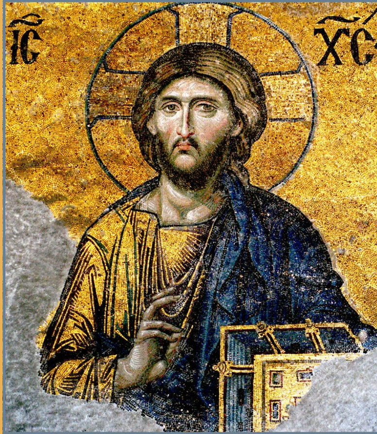
Moskos, Elias, Christ Pantocrator, 6th century a.d.