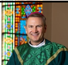
View a convocation photo at dijoliet.org

BESIDES CELEBRATING MASS ON SUNDAYS, a question people frequently ask me is, “What do priests do during the week?” My initial response is that priesthood is so much more than a 9-to-5 job—it is more like a 24/7 vocation.