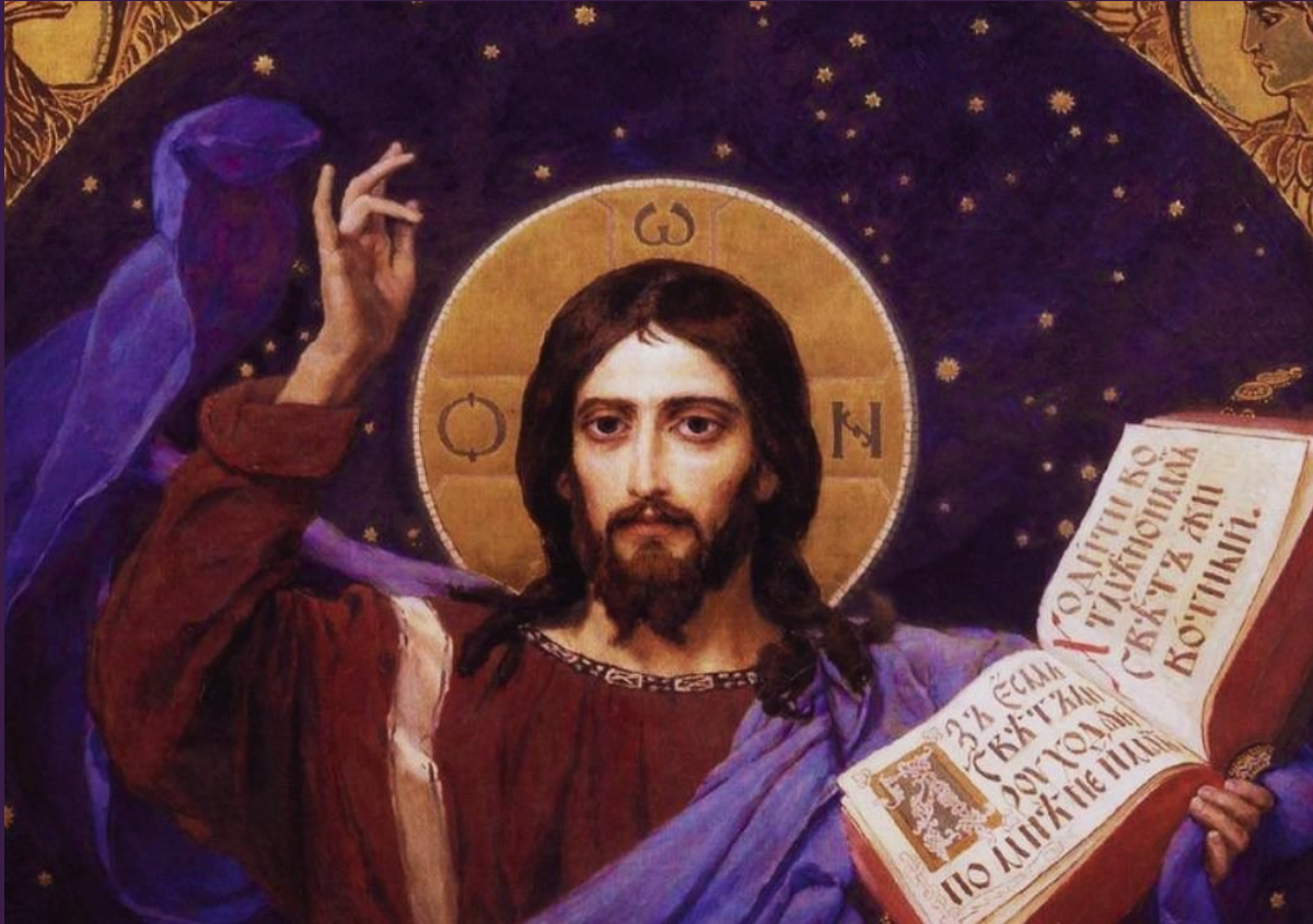
Vasnetsov, Viktor, Christ the King, 1885-1886, The Smithsonian American Art Museum, Washington D.C. , USA