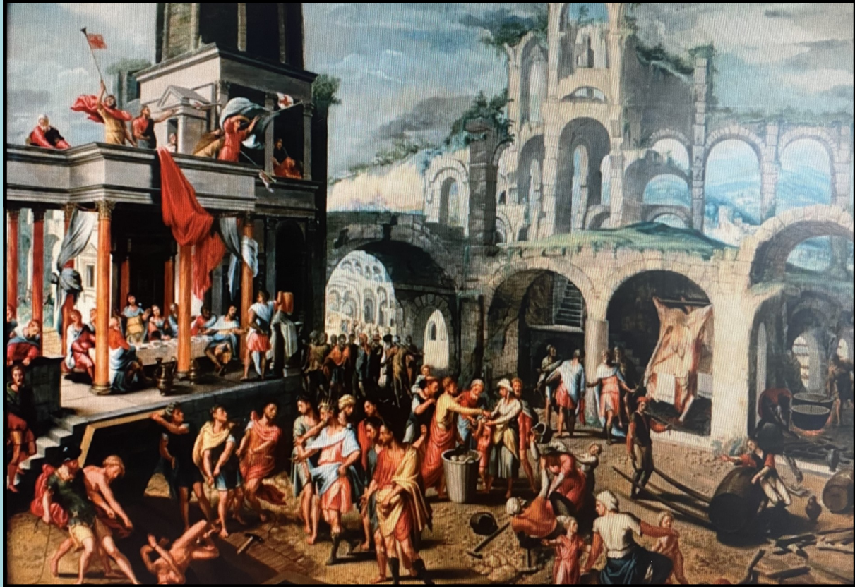
Artsen, Peter, The Parable of the Wedding Feast, 1550 a.d., Museum of Art Kammer, Jacksonville, Florida