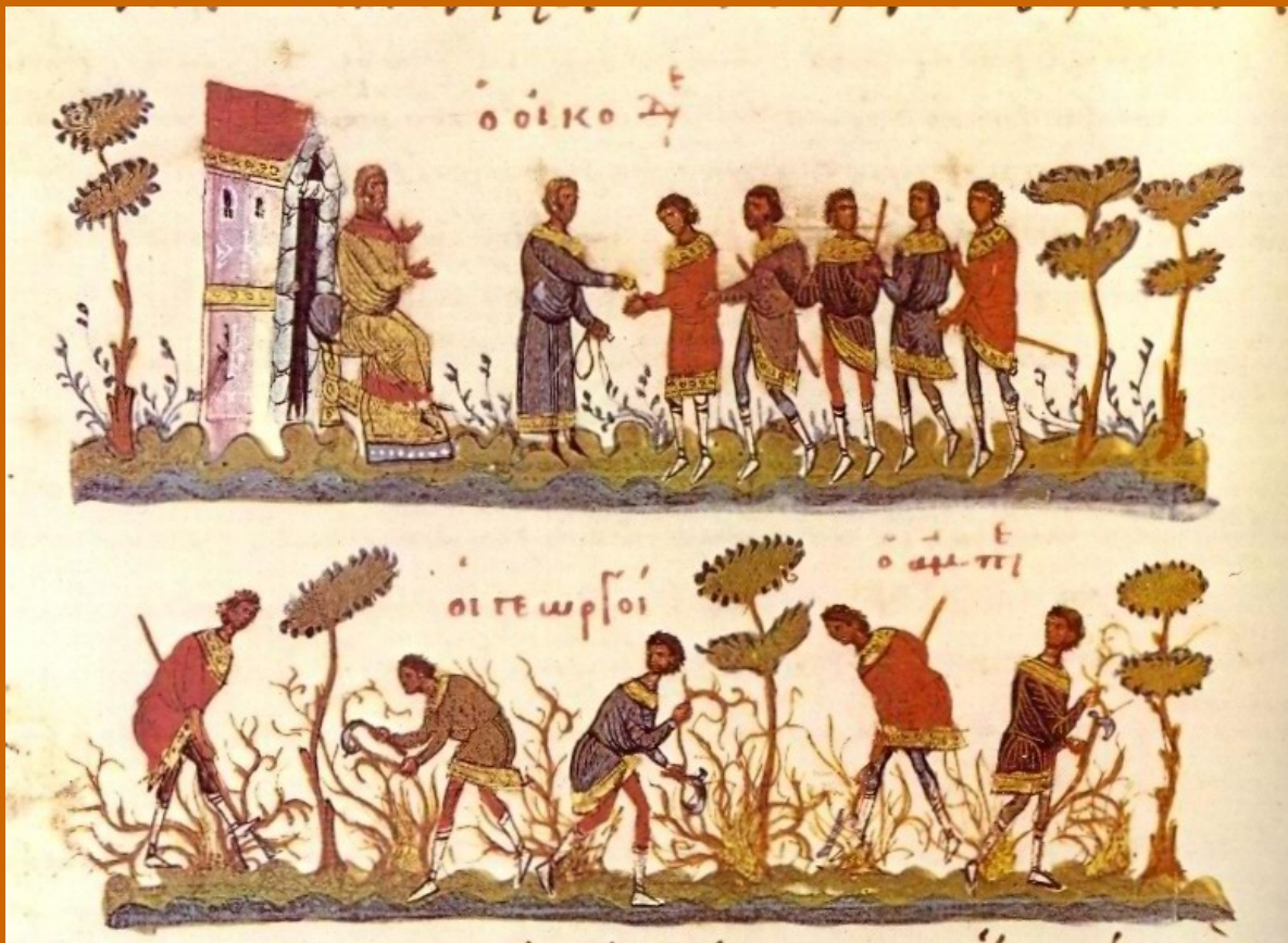
Author Unknown, Parable of the workers in the Vineyard, 11th Century, Bibliothèque nationale de France, Paris

Sunday, September 24, 2023 ~ Twenty-fifth Sunday in Ordinary Time