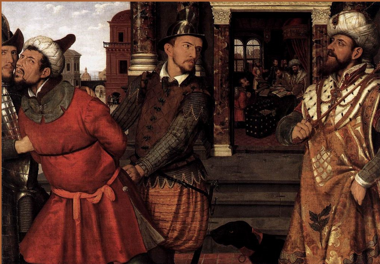
File:16th-century unknown painters - Parable of the Unfaithful Servant - WGA23794.jpg

Sunday, September 17, 2023 ~ Twenty-fourth Sunday in Ordinary Time