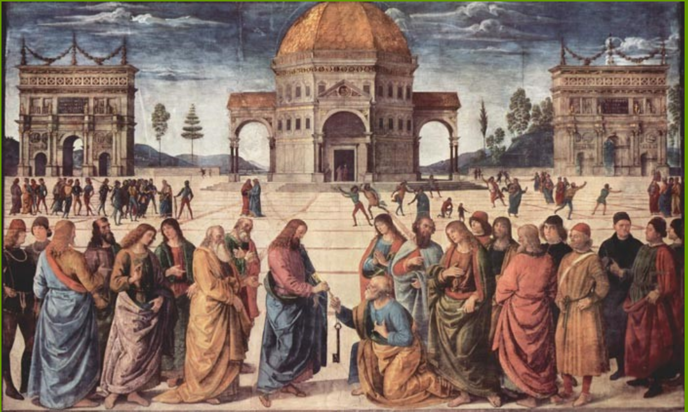
Pietro Perugino, Christ Handing the Keys of the Kingdom to St. Peter, Sistine Chapel, Vatican, Rome, Italy, 1481-83, fresco

"I say to you, you are Peter, and upon this rock I will build my church, and the gates of the netherworld shall not prevail against it. I will give you the keys to the kingdom of heaven. Whatever you bind on earth shall be bound in heaven; and whatever you loose on earth shall be loosed in heaven. Then he strictly ordered his disciples to tell no one that he was the Christ. " (Mt 16:18-20)