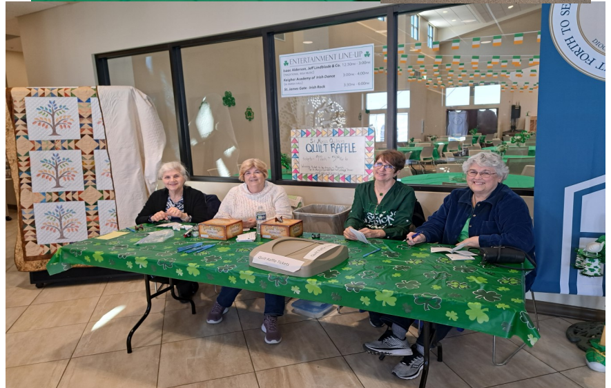
The Quilters sold many tickets