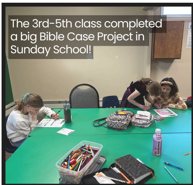
The 3rd-5th class completed a big Bible Case Project in Sunday School!