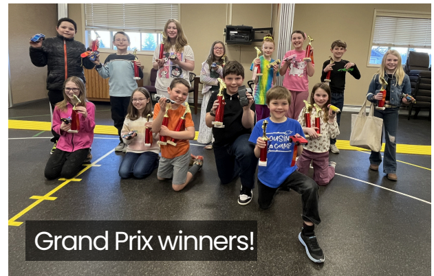
Grand Prix winners!

I bet the disciples played every moment of that final week over in their heads in the three days following His death, as they hid and grieved. They must've been astounded by the way He chose to spend His time and brokenhearted by the way they had ran away while He did what He came to do. And how sweetly He came to them after He was resurrected, and He comforted and loved them all the same.