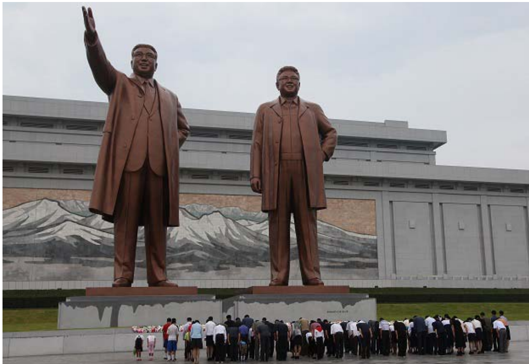
People in North Korea bowing down and paying homage before the 'Grand Monument' statues of Kim Il-Sung and his son, Kim Jong-Il. How long will it be before the 25 million people of North Korea once again worship Jesus Christ?

Many Christian and human rights organizations inform the world about the gruesome abuses that take place in North Korea. There are thousands of Christians currently languishing in North Korean prison labor camps, facing dastardly tortures that are comparable to anything depraved men have inflicted on one another in the history of humanity. In this newsletter we have decided not to focus on the rampant persecution in North Korea, but rather we would like to share a wonderful opportunity that exists for Christians around the world to help our brothers and sisters in this needy country.