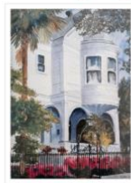
PRESBYTERIAN COMMUNITIES OF SOUTH CAROLINA

Next Sunday is Mother's Day! There will be a special offering taken up for Presbyterian Communities. Please consider your gifts to this vital ministry. Scan the QR code with your mobile device to be directed to OnRealm, where you may make your offering or tithe. (Text/Data rates may apply).