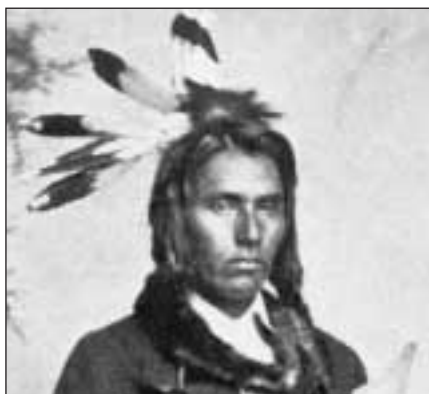
The Ojibwa Indian Chief Hole-in-the-Day (the Younger)

In 1926, eight physicians petitioned the Canadian Government to test Essiac on in large scale testing, saying "it relieves pain...reduces enlargement and prolongs