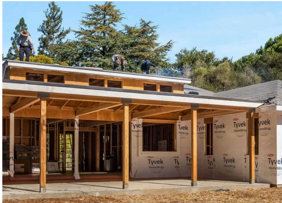
MENLO PARK LOUISE RESIDENCE