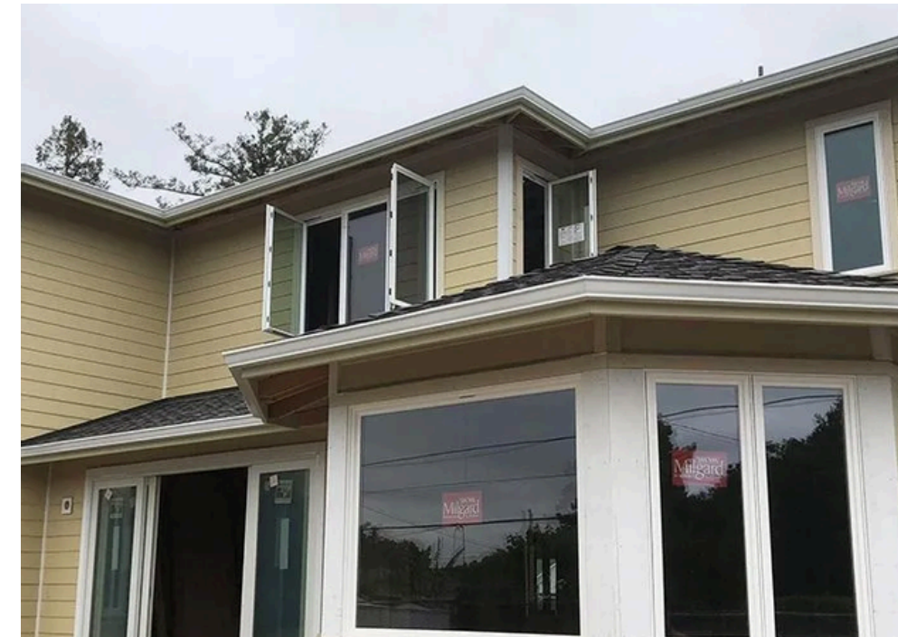
SAN JOSE CONTEMPORARY RESIDENCE