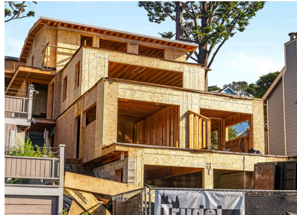
MOSS BEACH COASTAL RESIDENCE