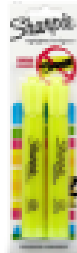
(1) MULTI PACK