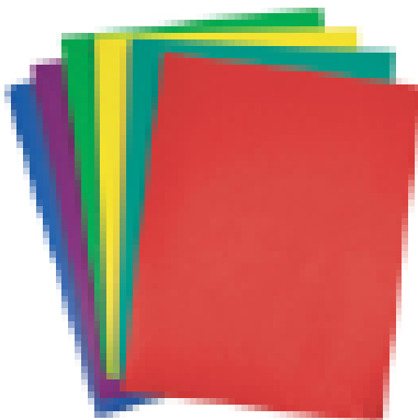
(4) PLASTIC ASSORTED COLORS POCKET FOLDERS