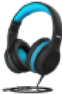
(1) PAIR OF HEADPHONES