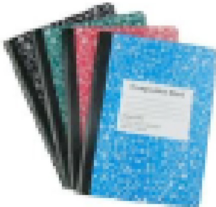
(3) WIDE RULED ASSORTED COLORS COMPOSITION NOTEBOOKS