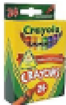
(1) BOX OF 24