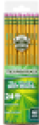
(1) 24 Count