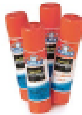
(1) MULTI PACK