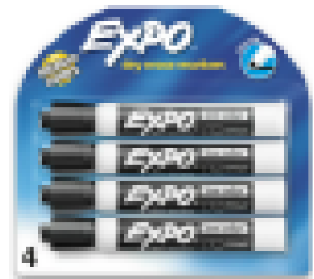
(1) MULTI PACK BLACK ONLY