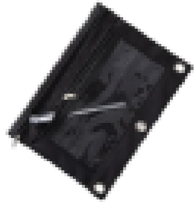
(1) PENCIL POUCH