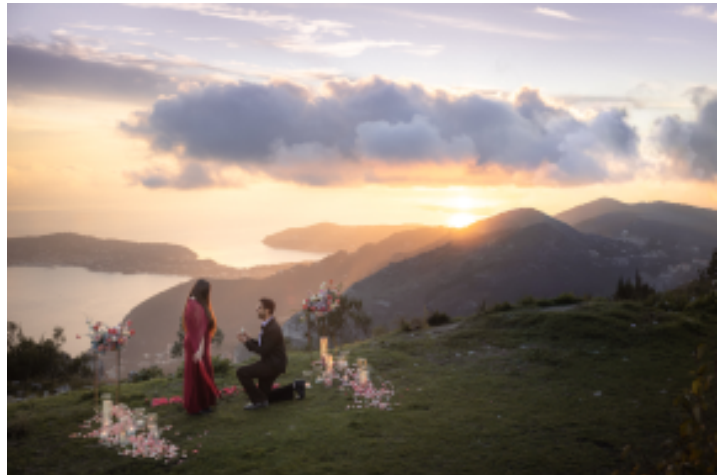
Flowers by Nusta

There is a minute logistical risk with this place during high-summer as if you're unlucky, they'll be someone already in your chosen spot picnicing or something. I'd say that would be unlucky, but not unfeasible, especially between May and September.