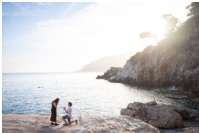
This image was taken here ( click here ).