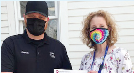
Town Fair Tire Foundation brought a new gift and source of support to The Upper Room this year and we are excited for this level of local connection in support of families.