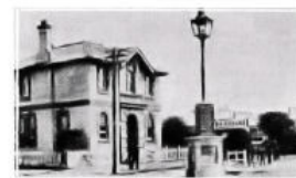
Levin Post-office 1903

HFHG bank account.38-9008-0466762-00. Name as reference or cash to Treasurer.