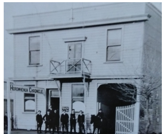
Horowhenua Chronicle 1910