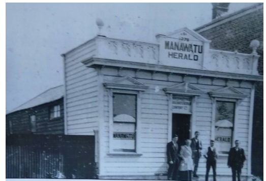
The Manawatu Herald(Foxton 1878)