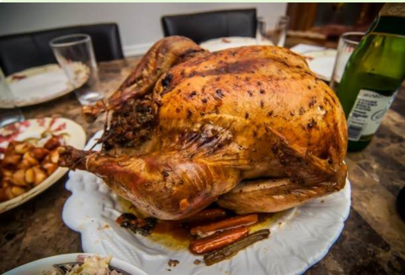
Turkey dinner with all the trimmings.

Tickets are $25 and can be reserved by phoning Carole at 838-6805 or Shirley at 838-6280.