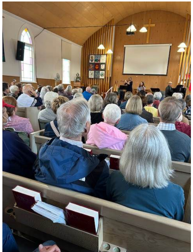
during the SUAS concert last Saturday, October 4

Please contact Lorraine Powell (250-838-7908) or Wilma Koersen (250-546-6463 / 780-933-9732) if assistance is needed.