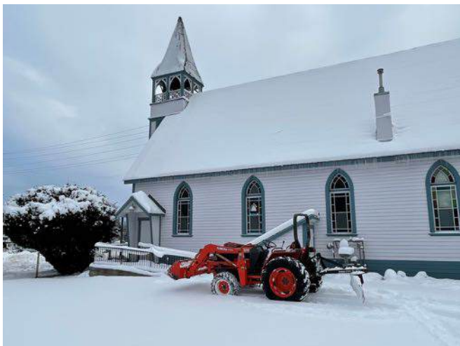
First Winter Snowfall.