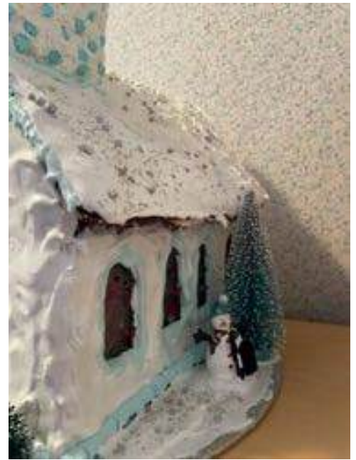
End result ginger bread house.