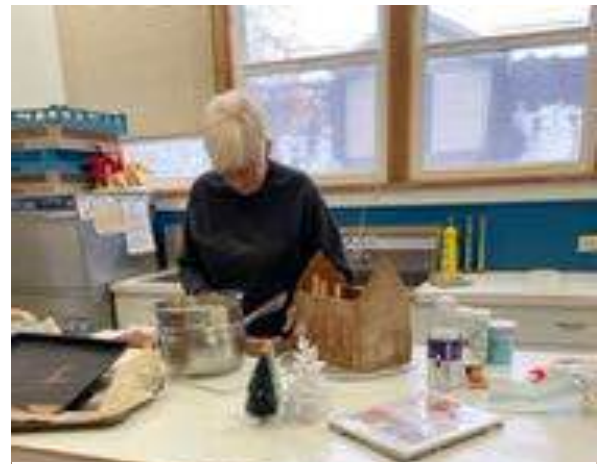
Gingerbread church under construction. On display at the museum this Christmas season.