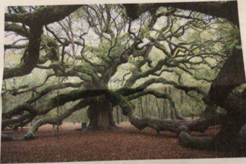
Tree of Life (Matthew 1: 1-17)