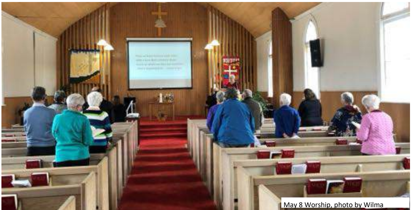
May 8 Worship