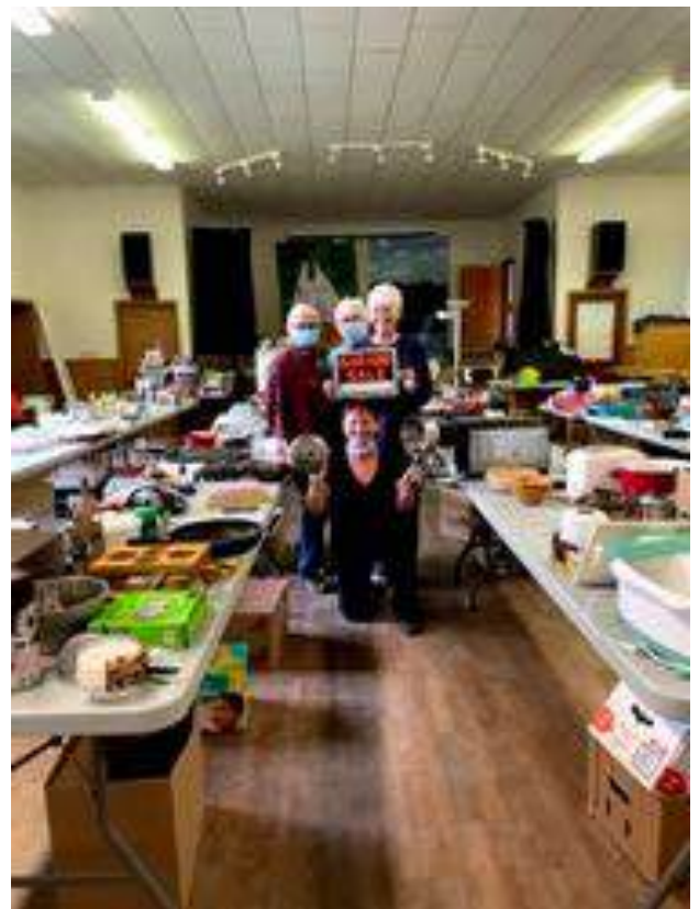
Garage sale set up. Last Friday May 13